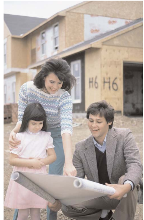
Many universities have extensive experience in operating service-learning/community-assistance studios.

5.3. ARCHITECTURE STUDENTS: Architecture students have the opportunity to be involved in providing pro bono services, either through their school's American Institute of Architecture Students (AIAS) chapter or through an academic studio or elective course. The best example of this is the AIAS's Freedom by Design program, a national program through which student chapters are engaged with local partners in promoting barrier-free environments through the removal of architectural barriers in their communities, most often their school's "home town." The students are required to form partnerships with local contractors and material suppliers and are responsible for raising the required funds or in-kind contributions needed to execute the removal of barriers. They are also required to work under the direction of a registered architect, preferably one who is a member of the AIA.